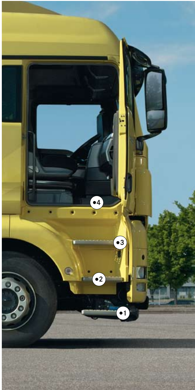
Conventional cab: entering a conventional cab involves a climb. Steps of differing heights (1-4) increase the time required to perform work processes