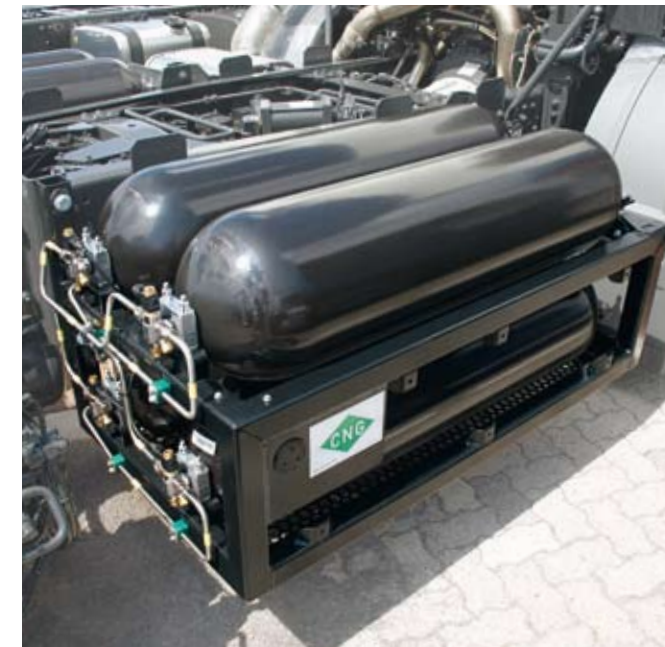
High-pressure tanks: protected by a solid steel frame, the gas bottles, along with the engine, lines, valves, etc. meet the high safety standards laid down in ECE R110