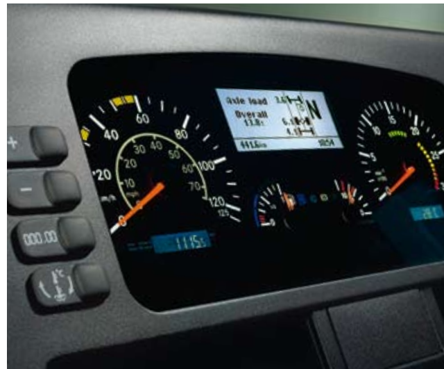
Instrument panel: the central axle-load measuring system provides a continuous display of the current load status and the gross weight of the individual axles

It goes without saying that particular emphasis is placed on safety: the cabs have a lightweight aluminium space-cage structure and meet the requirements of the ECE R29/2 crash-test standard.