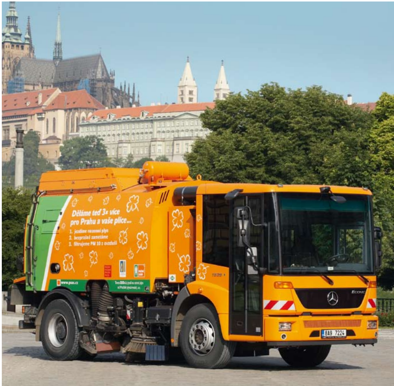
Gas-driven Econic sweeper in Prague: helping to keep the city and the environment clean